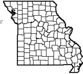
Worthwine Island Conservation

Equal opportunity to participate in and benefit from programs of the Missouri Department of Conservation is available to all individuals without regard to their race, color, national origin, sex, age or disability. Complaints of discrimination should be sent to the Department of Conservation, P.O. Box 180, Jefferson City, MO 65102, or U.S. Fish and Wildlife Service, 18th and C Street NW, Washington D.C. 20240.